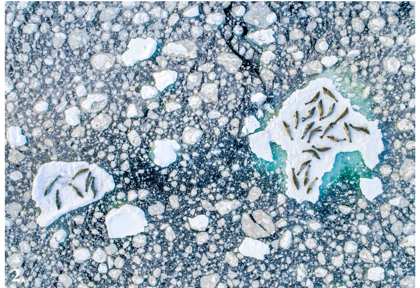
2. Aerial view of a colony of crabeater seals resting on the broken ice. Antarctic 3. Aerial view of a crabeater seal, Antarctic